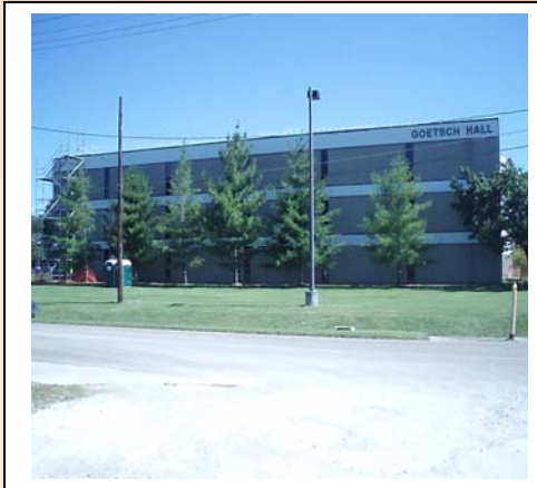
Building 768, Millington Naval Base, Millington, TN

The first project which is under way is the re-roofing of Building 768 (pictured to the right). This project consists of re-roofing ballast laid roof that is 50,000 square feet. This week the project should work closer towards completion as the crews have had great weather this week.