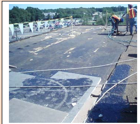
Safety is a priority on ALL of our projects.

Elite Roofing will begin mobilizing next week on its third project for the Navy. The project is a complete re-roof consisting of an HVAC salvage and removal. This project was a sole source award earned by Elite Roofing. The work on this project will go a long way to show Elite Roofing's capabilities.