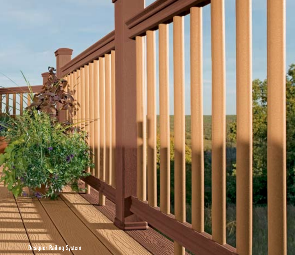
Designer Railing System