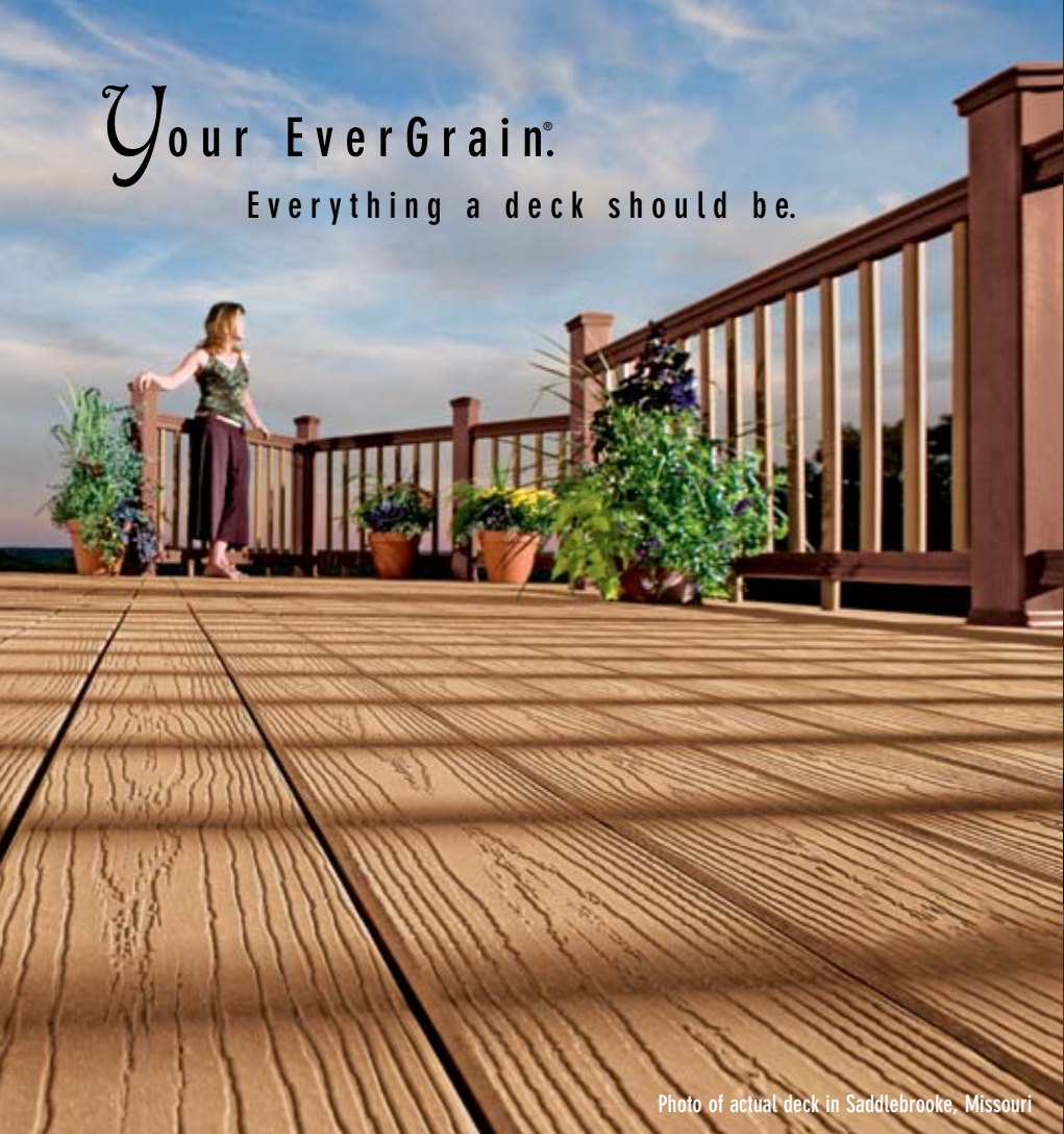
Photo of actual deck in Saddlebrooke, Missouri

Your EverGrain. ® Everything a deck should be.