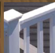
Tam-Rail™ Railing System