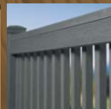
2x4 Traditional Railing System