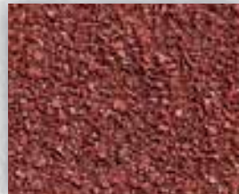
Garnet (Tile Only)