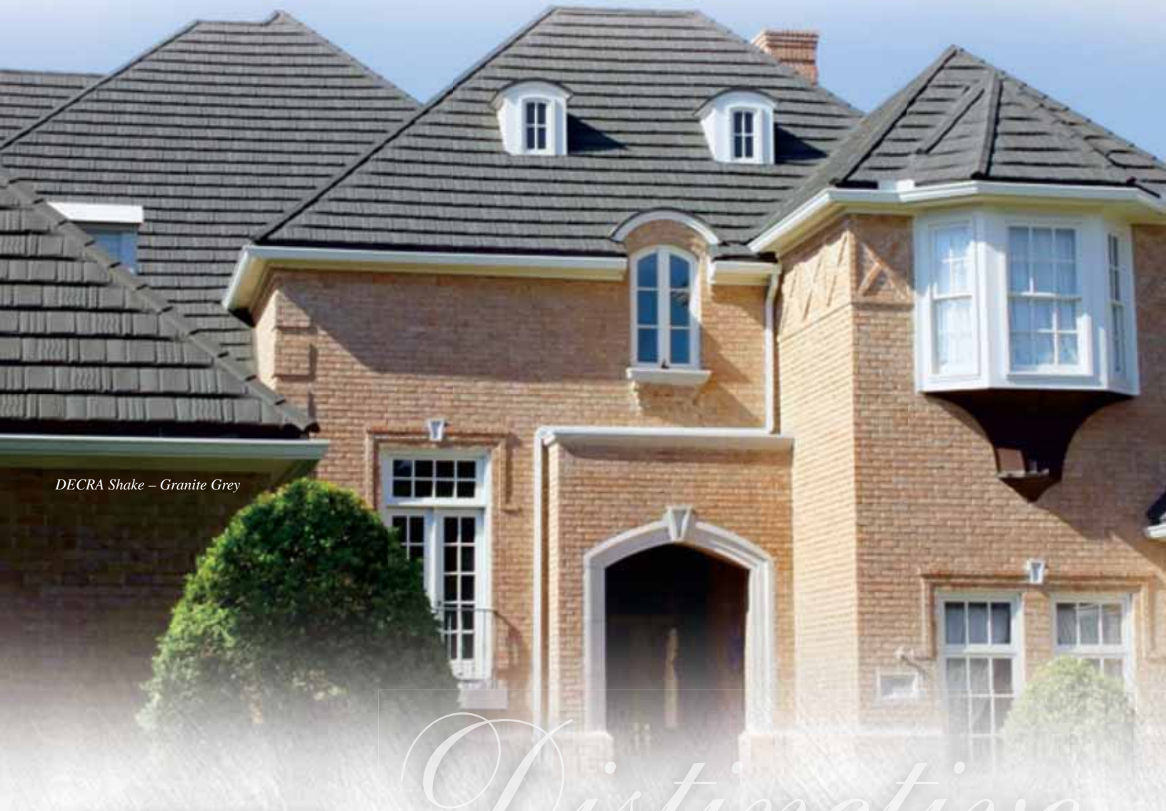
DECRA Shake – Granite Grey