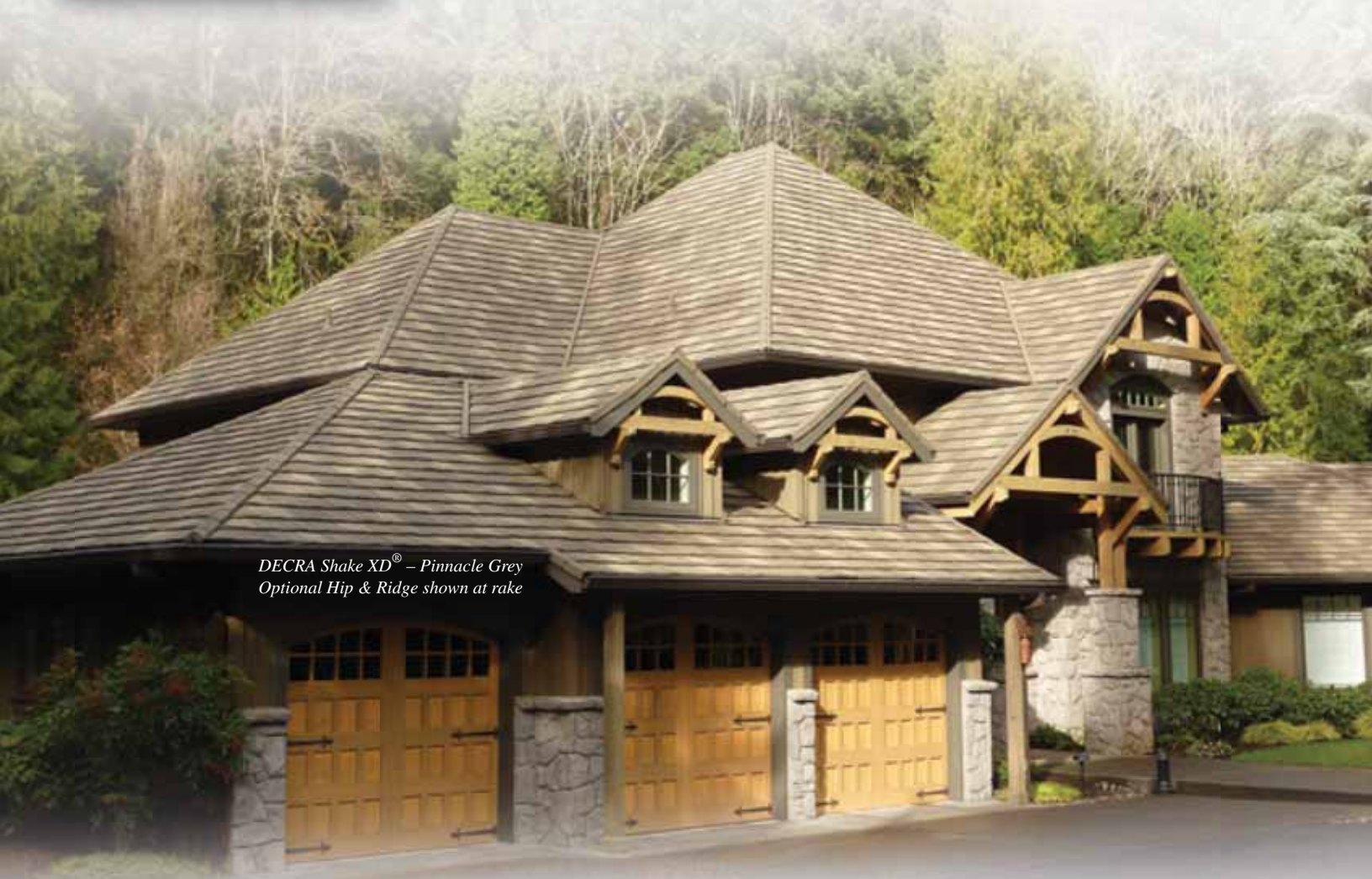
DECRA Shake XD ® – Pinnacle Grey Optional Hip & Ridge shown at rake

DECRA Shake XD ® offers the classic beauty and architectural detail of a thick, rustic, handsplit wood shake combined with the superior performance and longevity of steel. Shake XD ® is lightweight, durable and provides safety and security beyond other roofing products. The steel Shake XD ® panels support foot traffic and will not crack, split, curl or break like traditional wood shakes.