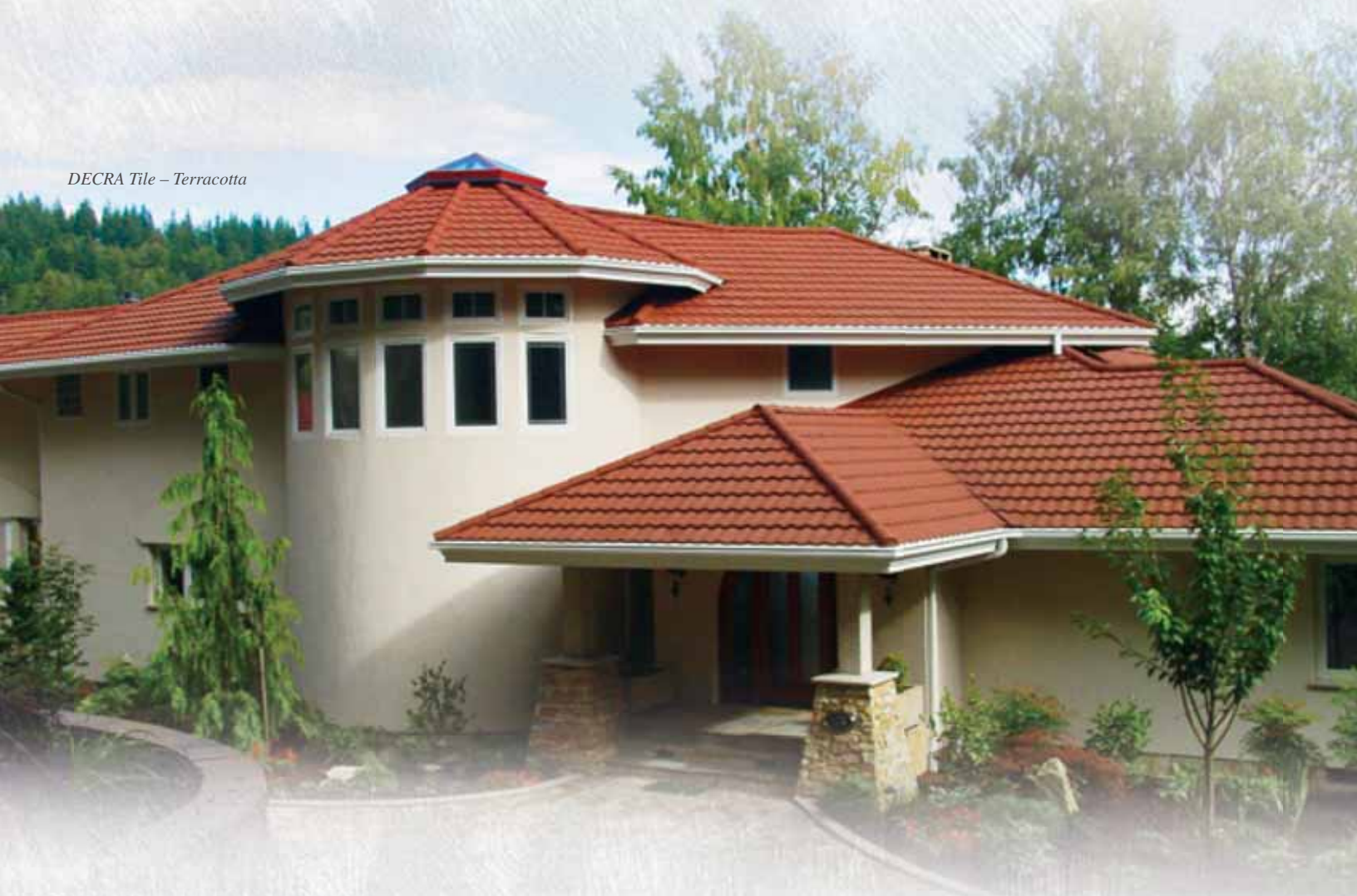
DECRA Tile – Terracotta

Offering the beauty and style of Mediterranean tile and the lightweight components of stone coated steel, a DECRA Tile roof adds a unique elegance to any home. With a long-standing reputation for performance, longevity and versatility DECRA Tile has been an ideal alternative to traditional tile products for over 50 years. From traditional Terracotta to an atypical Arctic Blue, a wide variety of colors is available.