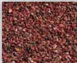
Terracotta (Tile Only)