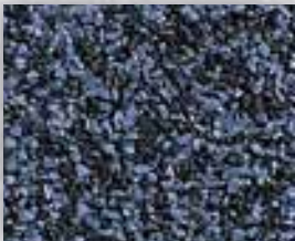
Arctic Blue (Tile Only)