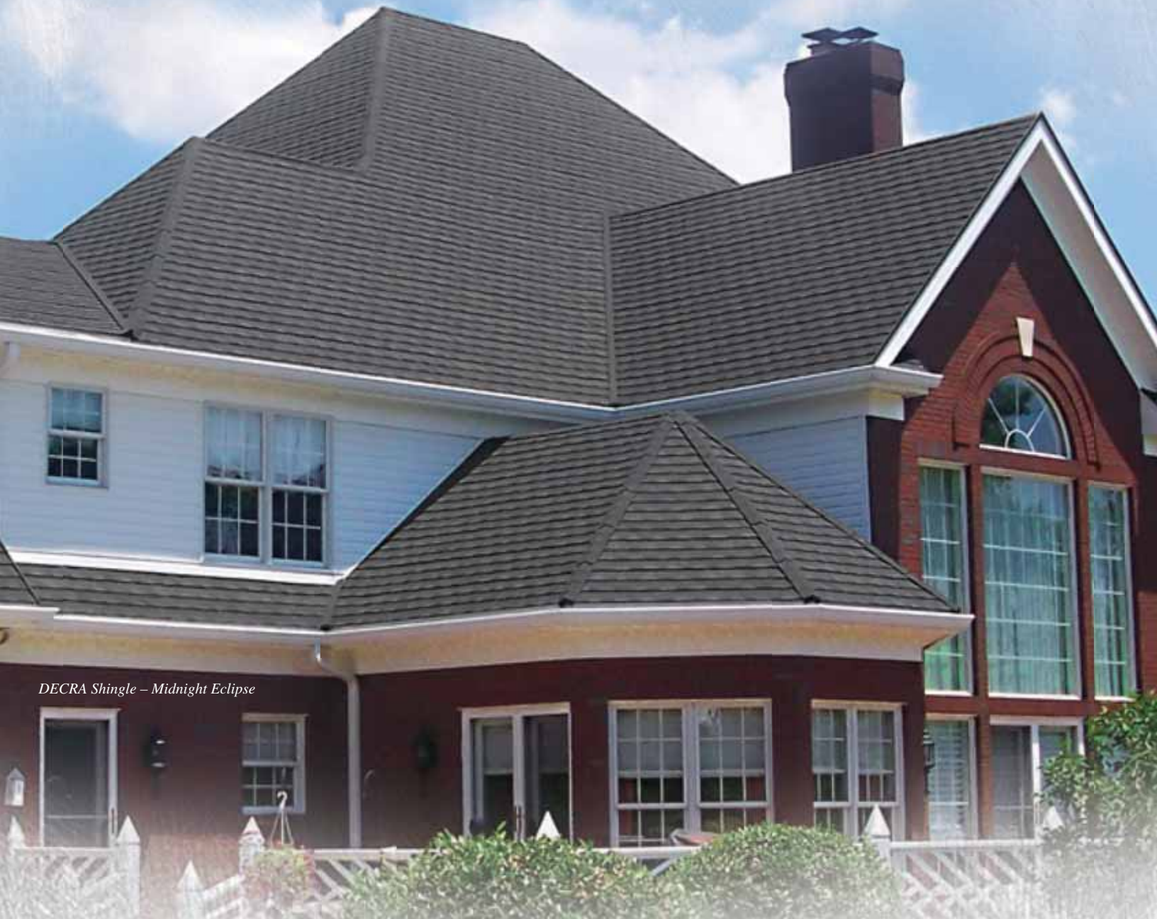
DECRA Shingle – Midnight Eclipse

If you are looking for the upscale design of a dimensional shingle, DECRA Shingle is the choice for you. DECRA Shingle offers a classic look that features a traditional distinctive style, reinforced with the strength and longevity of steel. Available in a variety of natural earth tone colors, these colors incorporate a subtle natural shadow, which enhances the richness and detail of the roof.